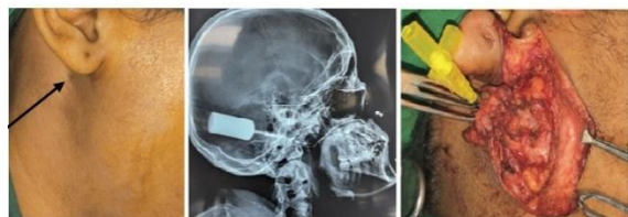
Figure 1: 1 st branchial arch anomaly with a fistulous opening in the right side just below the right ear lobule (marked by arrow). X ray fistulogram shows the tract communication with the Stensen's duct and draining into the oral cavity. Intraoperatively, the tract was delineated with the aid of an intravenous canula. It was excised in toto along with partial parotid tissue.

A 12-year-old female patient presented with an opening in the right side of neck just below the right ear lobule. X ray fistulogram showed a tract communicating with the Stensen's duct. Patient underwent complete surgical excision of the tract with partial parotidectomy. Post op period and follow up was uneventful [Figure 1].