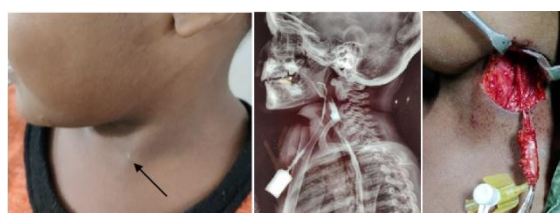
Figure 3: 2 nd branchial arch anomaly presented as an opening of the tract on the left side of neck at the level of anterior border of SCM (marked by arrow). X ray fistulogram revealed 2 nd branchial arch anomaly with a fistulous tract extending up to the left tonsillar fossa. Fistulous tract was delineated with the aid of an intravenous canula and was excised completely.