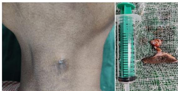
Figure 8: 4 th branchial cleft anomaly presenting as external opening of the tract on the left side of neck at the extending up to the left pyriform sinus. Fistulous tract was excised completely.

A 17-year-old male presented with a history of discharging fistula point in the left side of neck with scar tissue around it due to previous incision and drainage done elsewhere. X ray fistulogram showed collection of dye in the left pyriform sinus. Surgical excision of the tract along with the scar tissue was done. [Figure 8]