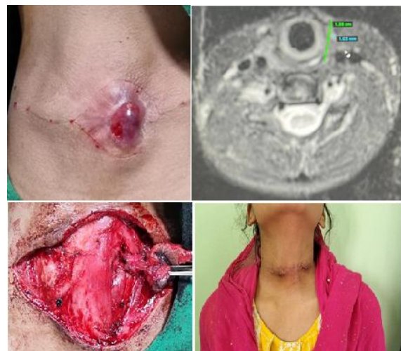
Figure 7: 4 th branchial arch anomaly presenting with fistulous opening along with inflamed scarred tissue in left side of neck just anterior to anterior border of SCM. A T2 hyperintense thin tract is noted arising from loculated collection around the superior border of left lobe of thyroid gland opening into left pyriform sinus. Intraoperatively, the fistulous tract was seen entering the pyriform fossa just behind the posterior border of thyroid cartilage (marked by arrow).

A 16-year-old female presented with history of intermittent mucopurulent discharge from right side neck, from past 8 years. Patient had undergone incision and drainage twice elsewhere. On examination, a fistulous opening along with inflamed scarred tissue was present in left side of neck just anterior to anterior border of SCM. CEMRI Neck showed left sided 4 th branchial cleft fistula. Complete surgical excision of fistulous tract along with the scarred tissue was done. (Fig 7) Post operative period was uneventful.