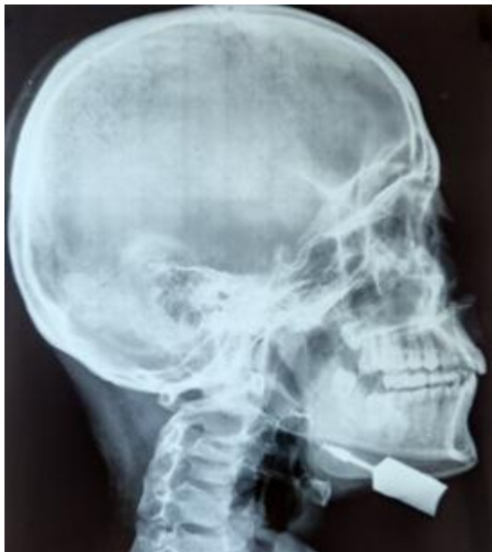
Figure 5: X ray fistulogram showing 2 nd arch anomaly tract extending from a fistulous opening present in right side of neck at the level of angle of mandible up to the right tonsillar fossa.

Case 5: A 20-year-old female presented with a fistulous opening present in right side of neck at the level of angle of mandible. X ray fistulogram showed tract extending up to the right tonsillar fossa [Figure 5].