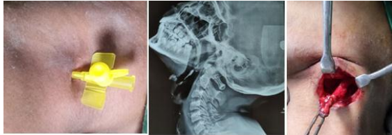
Figure 4: 2 nd brachial arch anomaly with fistulous opening in the left side of neck. X-ray fistulogram showed a complete tract extending up to the left tonsillar fossa. The tract was identified and removed in toto.

was seen coming out from the floor of left EAC. Patient was managed with systemic antibiotics followed by CT fistulogram which showed stained tract leading up to the left EAC. Patient underwent second surgical excision where the tract along with cuff of surrounding tissue was excised along with previous surgical scar tissue. Post operative period was uneventful and histopathological examination of the specimen was suggestive of fistulous tract.