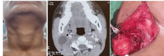
Figure 6: 2 nd arch anomaly presented with a cystic swelling in the right side of neck at the level of hyoid bone (marked by arrow). CECT Neck showing a cystic swelling (marked by arrow) abutting the carotid sheath. The cyst was excised in toto.

A 15-year-old male presented with a cystic swelling in the right side of neck at the level of hyoid bone. CT scan of the neck was suggestive of 2 nd brachial arch cyst type II (Fig 6). Patient underwent complete surgical excision with removal of cyst in toto. Histopathological examination of the specimen was in favor of branchial cyst.